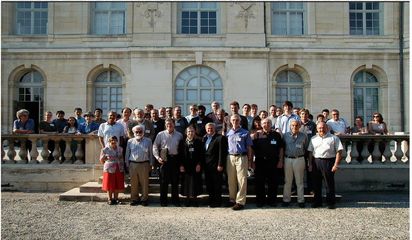
En haut: July 2010 Paris. En bas: July 2013 Paris: Les participants dont trois laureats du prix Nobel de Physique en Cosmologie 2006-2012, et six medailles Chalonge, réunis sur la méridienne de Paris.