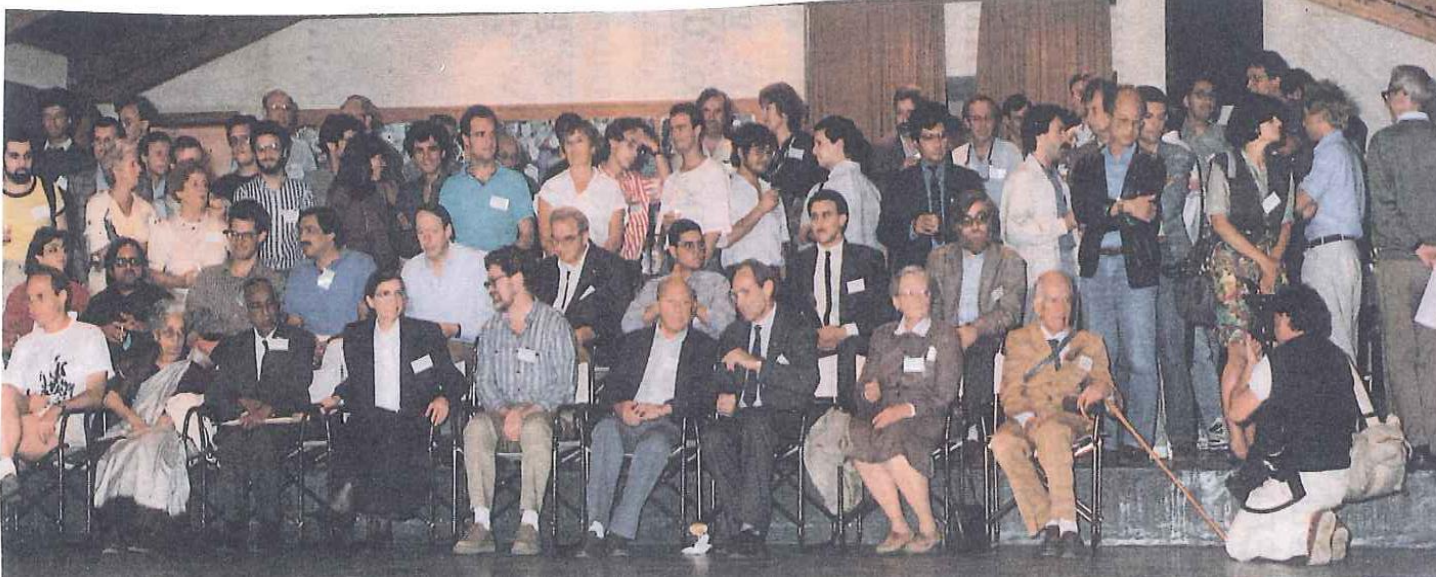
Inauguration of the Chalonge School : First course on Astrofundamental Physics, septembre 1991.