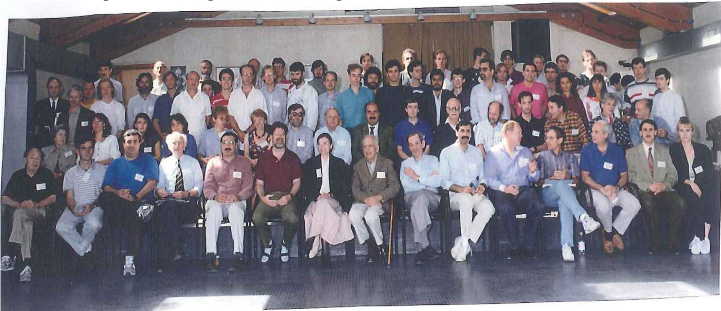
Chalonge School 2nd course on Astrofundamental Physics, septembre 1992